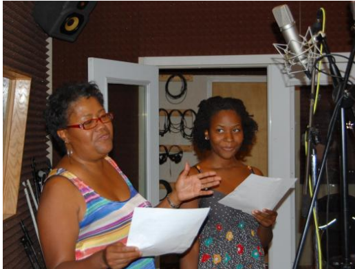
Two of the gifted singers from the Revived Choir